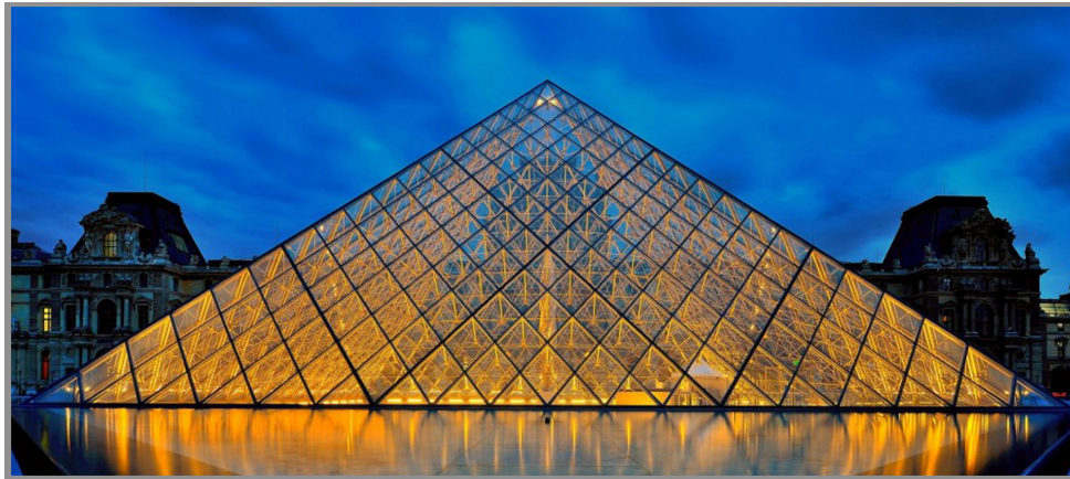
Figure 2. Picture from the Internet