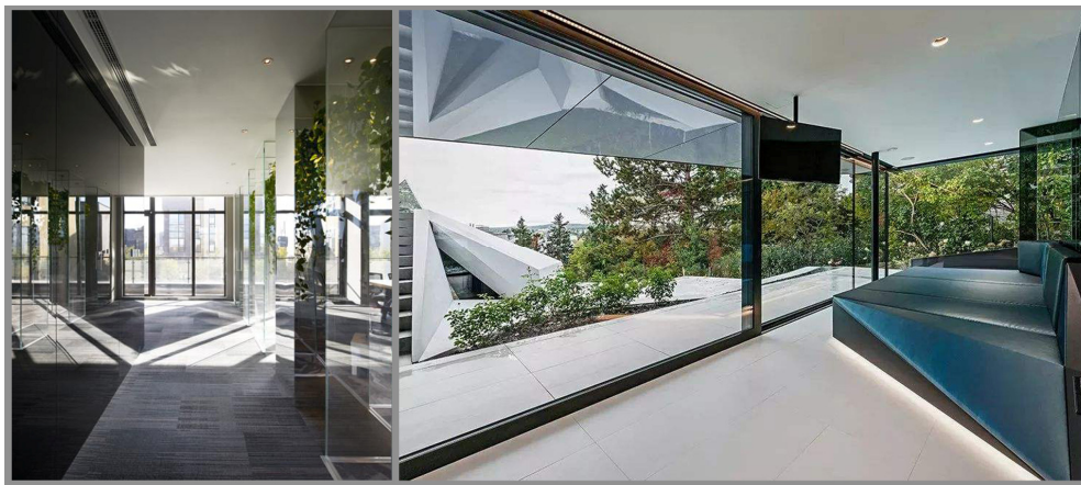
Figure 1. Picture from the Internet

The form of plane composition is widely used in contemporary art. Its main purpose is to partition the space and form a new space range. To a certain extent, it changes the original spatial form. Because of its better light permeability, It provides good conditions for rendering the atmosphere of the space. Common practices take environmental decoration as an example, such as glass walls and glass doors. We often see that in a small space, there will be a neat row of corresponding glass mirrors on the wall, so that through his infinite mirror reflection, the small space gives the illusion of infinite magnification and eliminates the depression of the indoor space. It also has a good decorative effect. Enriching the original spatial form level.