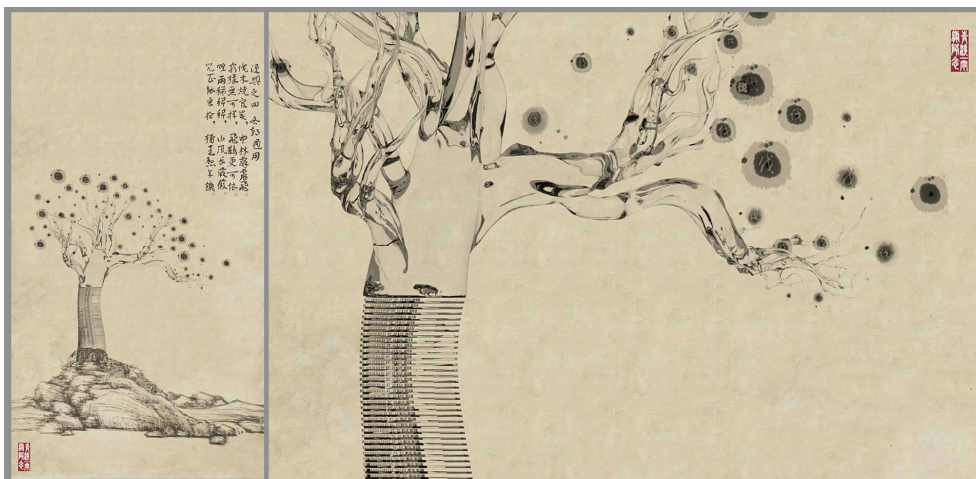
Figure 3. Green and Green Light Dropping a Thought

The impression of glass is generally that it is fragile, and there will be a very long and boring part in the production process, which is divided into cutting, hot melting, casting, carving, polishing and traditional blowing. Regardless of the method used, the ultimate goal is to make the work take shape. There is no real time for completion of any work of art, and the same is true for glass works; for example, the work "Green and Green Light Falling A Thought" was produced in 2018 October.